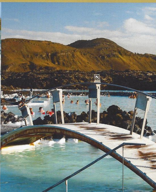
Relax in the Blue Lagoon, warmed by forces of nature