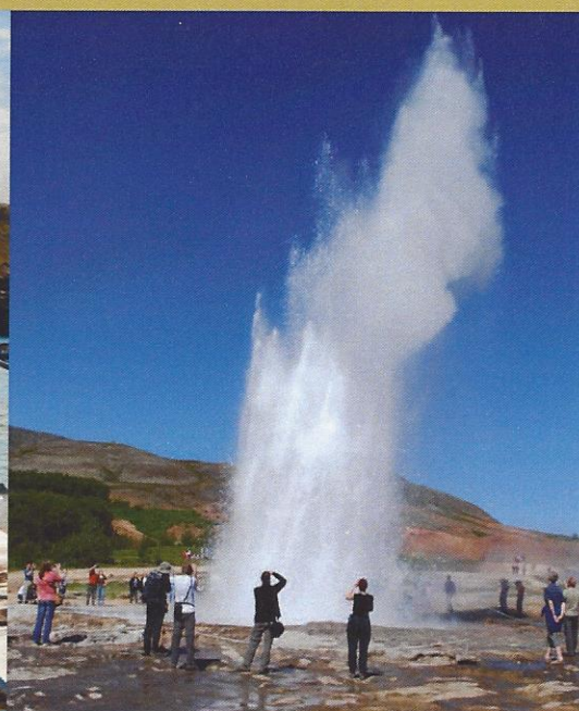
A geyser erupts for camera-wielding travelers

most active volcanic areas in Iceland. Visit the geothermal area of Krysuvik and Lake Kleifarvtn with its hot springs and solfatares. The moonlike surroundings of the lake never fail to leave a strong impression on visitors!